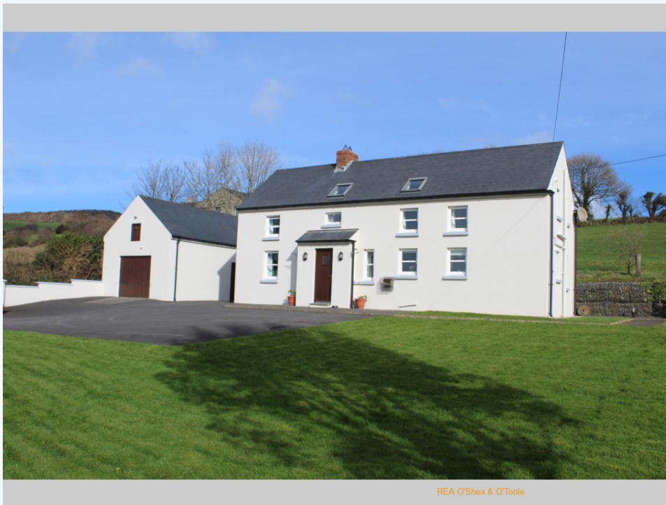
REA O'Shea & O'Toole